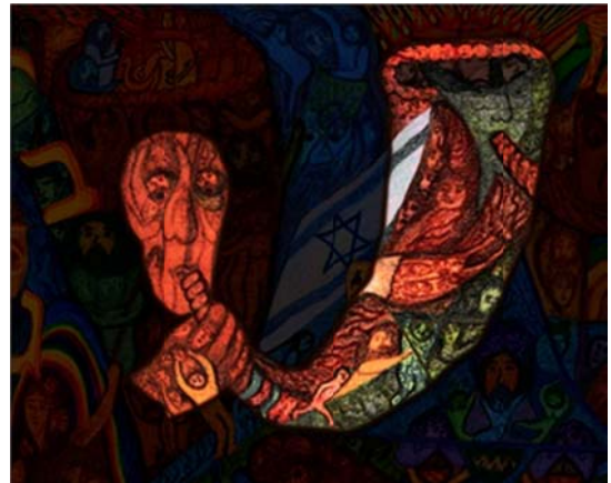
Joshua blowing the shofar

In the brown area to the left of the Israeli flag (on the eagle's wings), smaller forms compose the larger face of Joshua, seen holding and blowing a shofar. This same brown area is also the base of a larger shofar seen swirling out from beneath and around the tablets of the Ten Commandments. (Look closer, within the large hidden shofar, the Israelites make their long journey through the wilderness.)